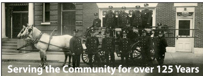
Serving the Community for over 125 Years